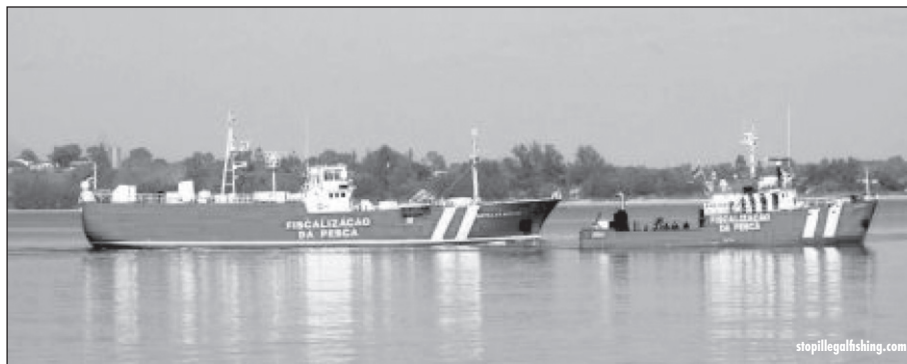
The Antillas Reefer, an illegal fishing vessel, was confiscated in Mozambique and converted into the “Fiscalizacao Da Pesca”, or Fisheries Patrol Vessel (left).

Here are two examples of IUU cases investigated by OLE.